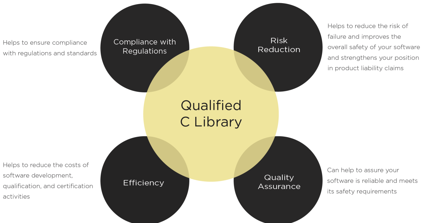
Figure 1: Rationale for using the Qualified C Library